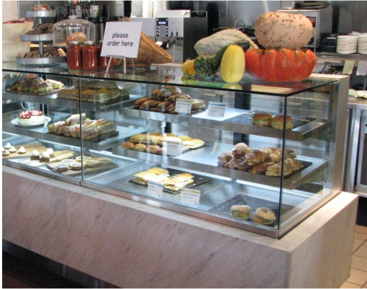
SQR 4848 W/STAINLESS STEEL SHELVES